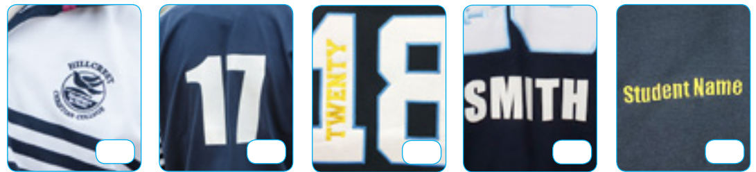
School Crest Vinyl Number OR Applique Number Nickname (Back) Individual Name (Front)

For reverse and alternative decorations, please refer to page 14